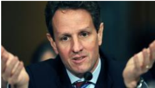
Tim Geithner US Treasury Secretary

Our tax system is so corrupt and complicated not even the head of the IRS can figure it out..